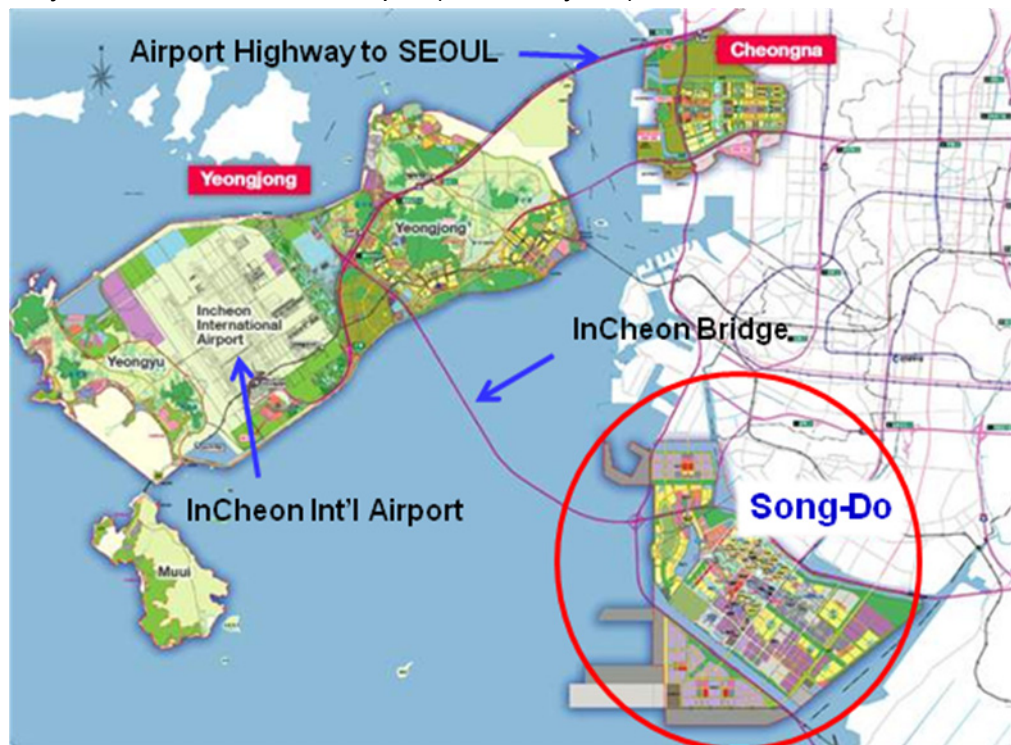
(The west part of Incheon)